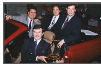
1994 Mustang GT with the Mach 460 Design Team and prototype Mini-Disc player on display at Ford WHQ

Additional Info: Worked at over 30 years as a Technical neer, and Business Planner. tems, I was involved in the de- ‘87 Lincoln Town Car; Graphic Tape Player in ‘89 Lincoln in ‘93 Mark VIII; Mini-Disc System for Mustang in 1994.