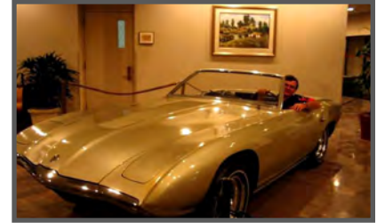
On display at SAAC 29 in Ypsilanti, MI