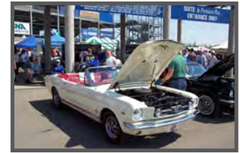
In the “K-car Corral” at the 40th Anniversary Show in Nashville, TN