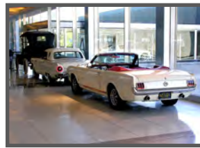
My Mustang and Thunderbird in the Lobby of Ford WHQ in 2003