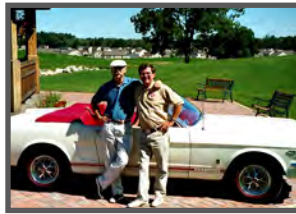
Featured on “My Classic Car” with Dennis Gage in 2002